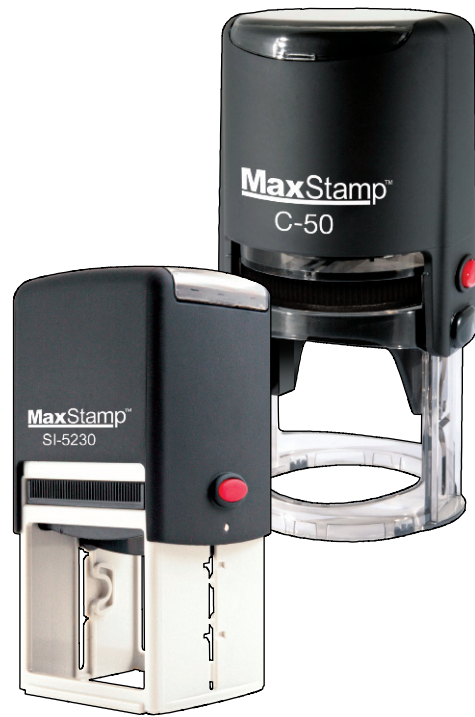
A. C-12 Custom Stamp

PRIORITY ORDER SHIP VIA 2ND DAY OVERNIGHT